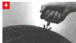
4 SPINGERE LA STRINGA NELLA GOMMA SUPERANDO LO SPESSORE DEL PNEUMATICO