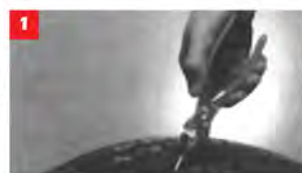
1 RIMUOVERE OGNI OGGETTO DALLA GOMMA

LA STRINGA AVRÀ ASSUNTO QUESTA FORMA FACENDO IN MODO CHE QUANDO SI AUTOVULCANIZZERÀ GRAZIE AL CALORE DATO DALLA VELOCITÀ DEL VEICOLO LA RIPARAZIONE SARÀ SIA INTERNA SIA SU TUTTO LO SPESSORE DEL PNEUMATICO, IMPEDENDO ALL'ACQUA DI ENTRARE E MAGARI CREARE RUGGINE NELLE TELE METALLICHE.