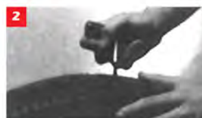
2 PULIRE ED ALLARGARE IL FORO CON LA RASPETTA