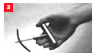
3 INSERIRE LA STRINGA NELL'ATTREZZO A "T" CON AGO