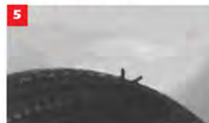
5 ESTRAENDO L'ATTREZZO L'AGO LASCERA' LA STRINGA NELLA GOMMA