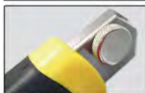
Rotella per blocco lama